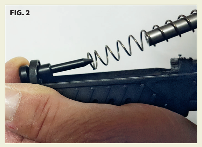
Insert the edge of the spring in the tip of the assembling tool. (FIG. 2)