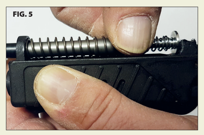
Align the recoil rod and let it sit on the barrel rod position. (FIG. 5)

Release the assembling tool and push until the recoil rod passes a little from the slide hole. (FIG. 4)