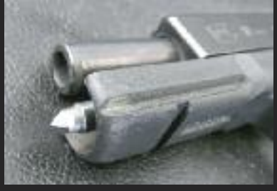
ONLY FOR GLOCK GENERATION 4

2. DPM Recoil Reduction System in Titanium Version with Carbide Tip for Car Glass Breakage. Extreme Tactical Use. Professional Effectiveness. Your Glass Breaker is Always Ready for Action.